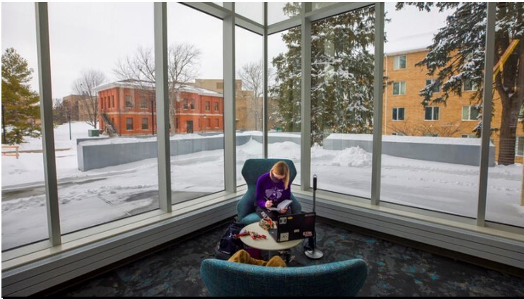
A student takes advantage of some study time in the Dinsdale Family Learning Center, the new name of the renovated former C.Y. Thompson Library.